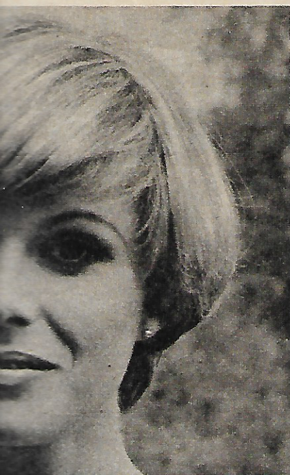
1. Joanna Lumley is Purdey, Steed's latest "Avengers" girl. She looks innocent enough but don't be fooled. She's quick and deadly as well as sophisticated.