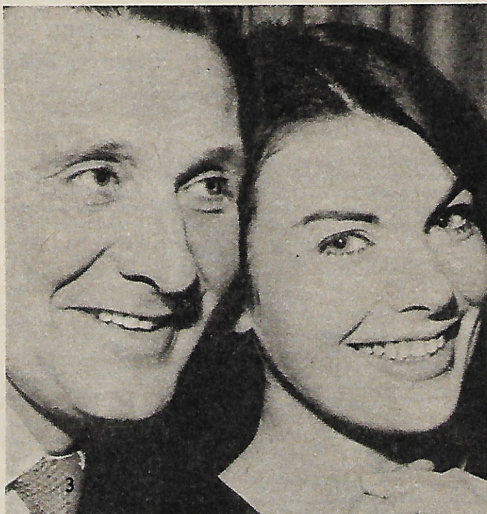
3. Patrick Macnee with his second wife, Kate Woodville. She was an early "Avengers" girl. Patrick says the marriage didn't last because she was 16 years younger.

to actress Kate Woodville didn't last he says, because she was 16 years younger. "And I think I bored the hell out of her."